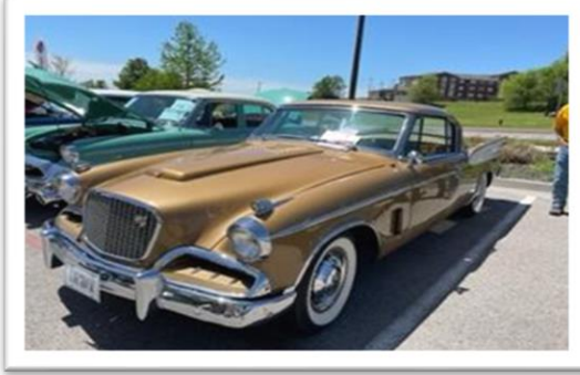
This one is for sale